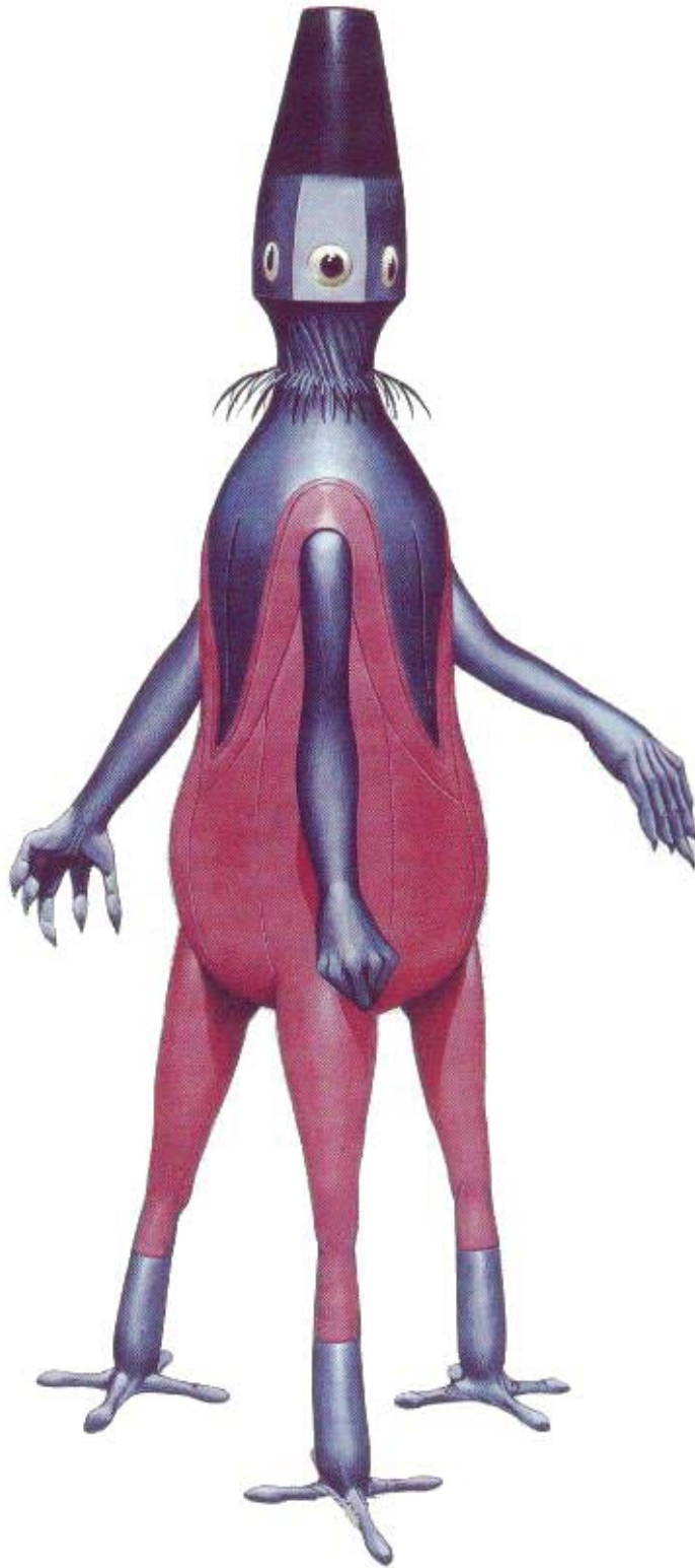
SANRISS Enforcer for hire