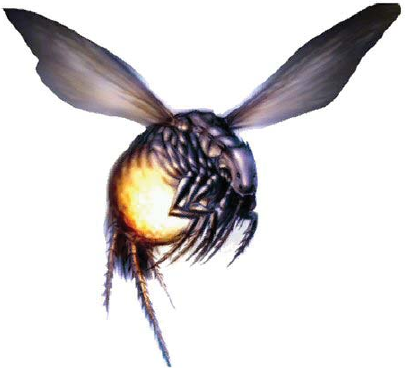
ZEENIN Guide, Mount for hire