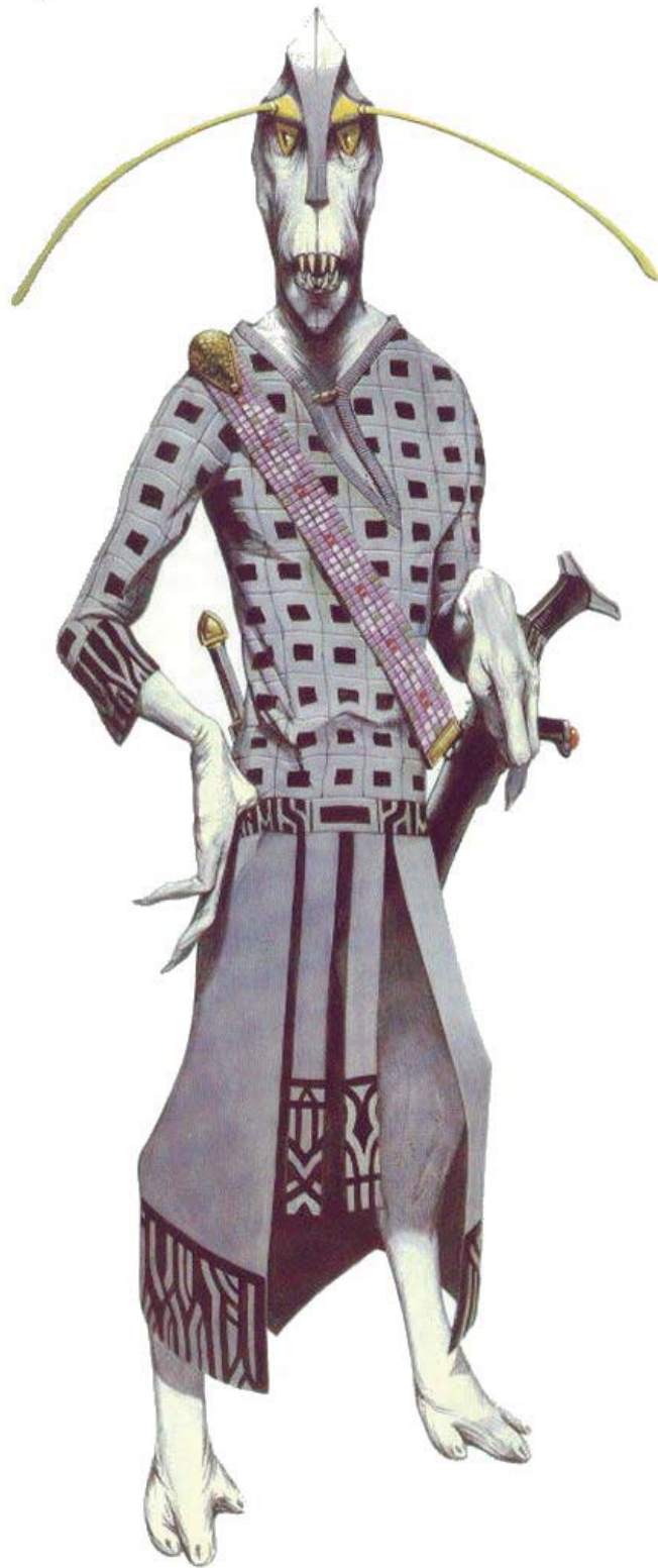
KALDUN Soldier, Bodyguard