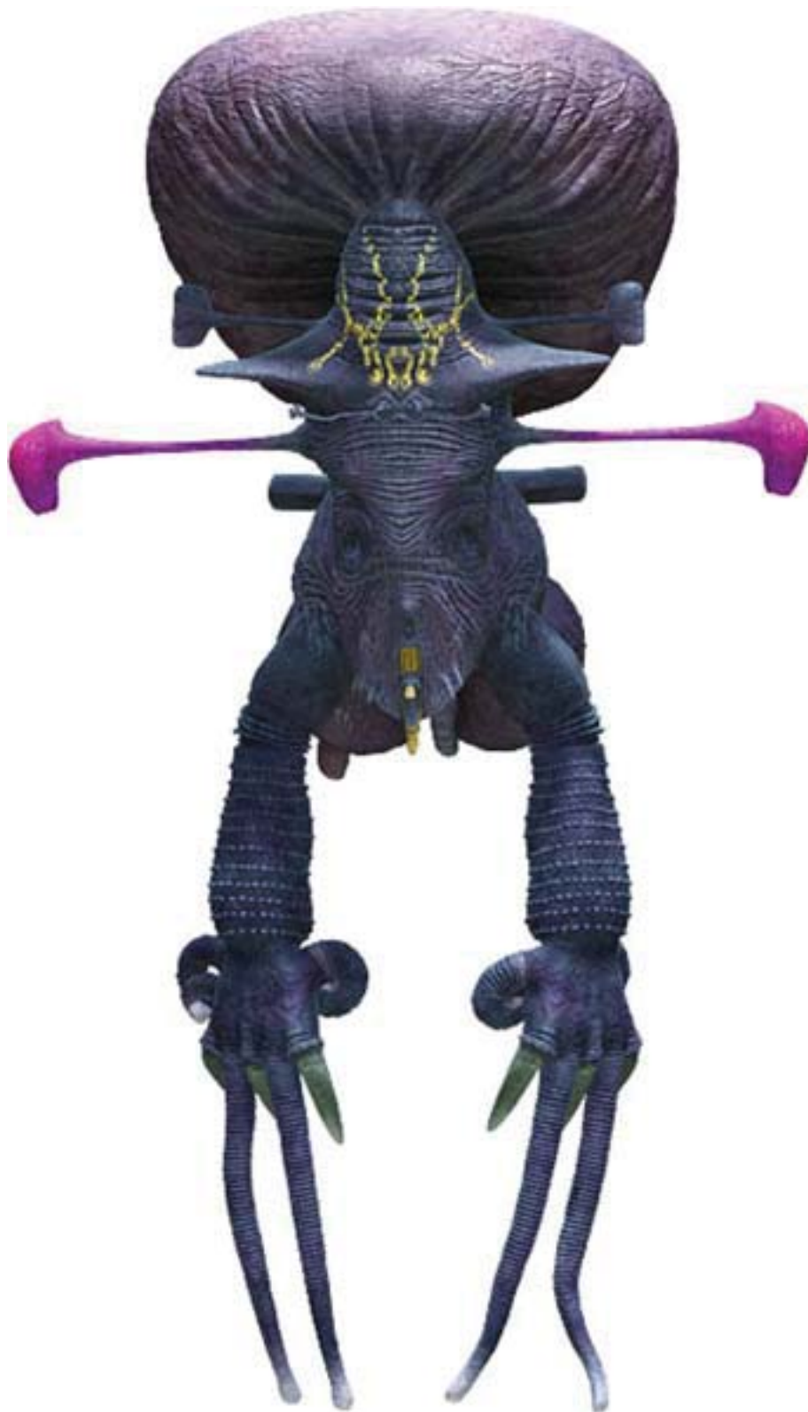
IFFRI Psionicist, Healer