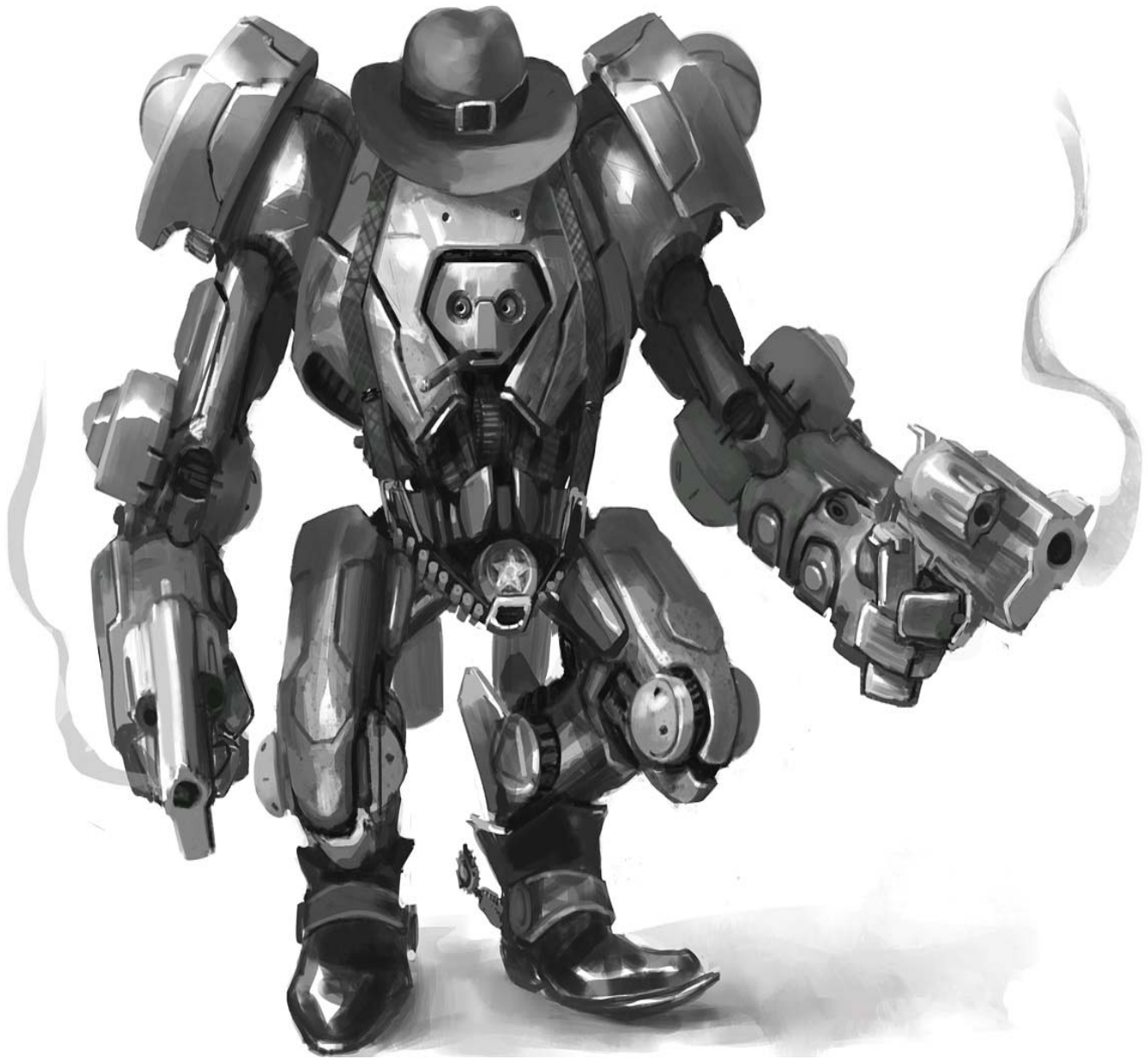
TK-472 ("TEX") Security, Bodyguard