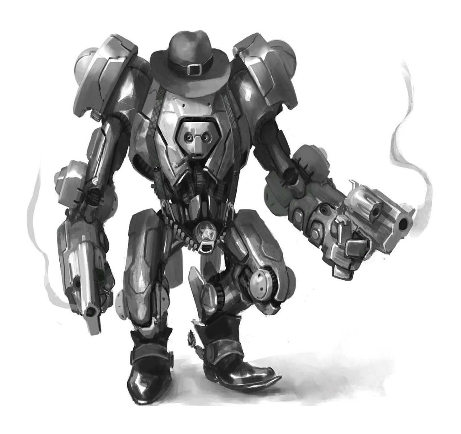
TK-472 ("TEX") Security, Bodyguard