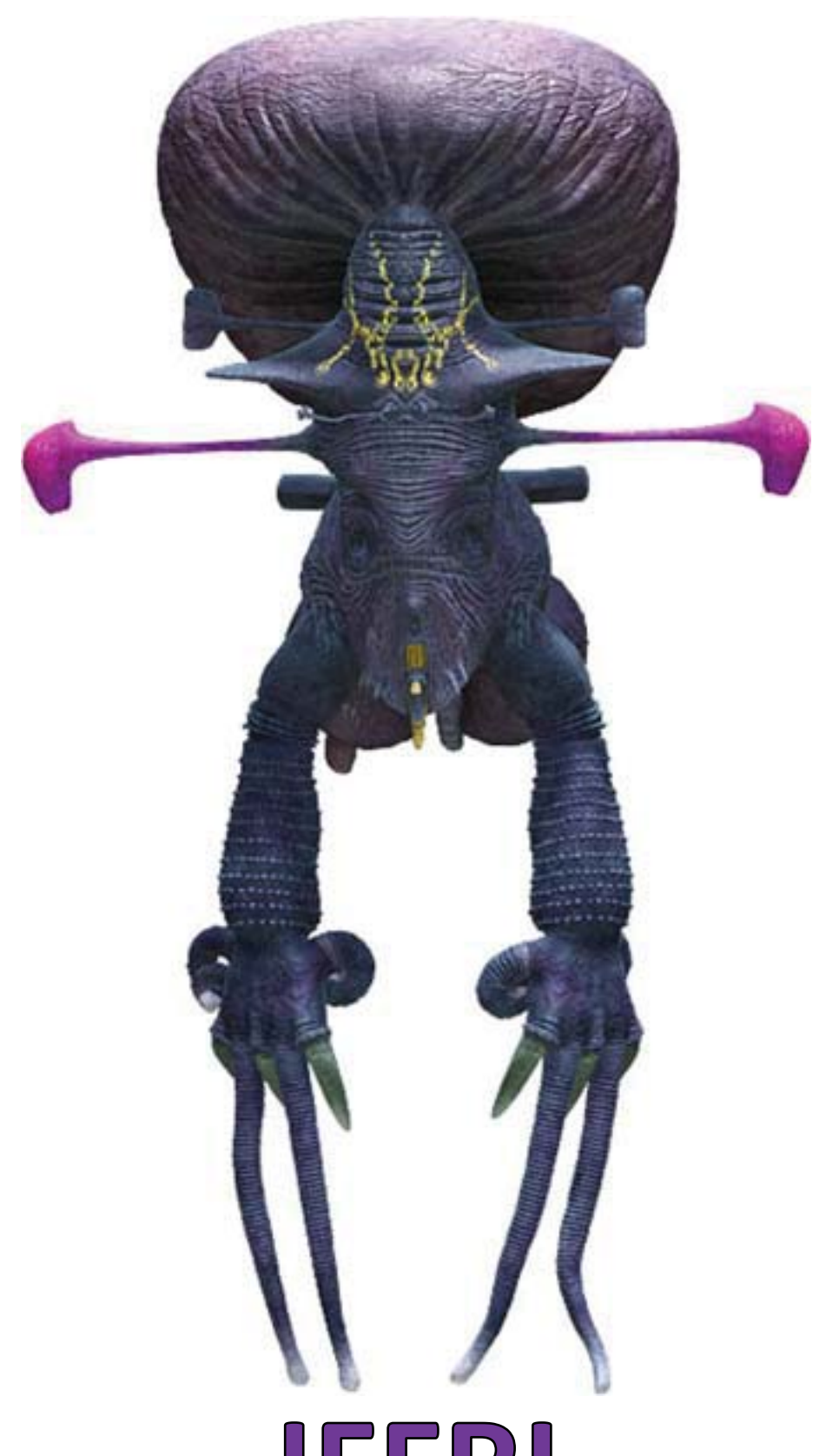
IFFRI Psionicist, Healer